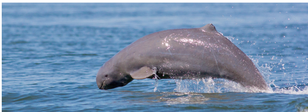
The Irrawaddy River, which is one of the only large, free flowing rivers left in highly populated areas, is home to the Irrawaddy Dolphin, classified as Critically Endangered by the IUCN Red List.

While the global CSI study is the most comprehensive standard to date and is a useful reference, banks should not solely rely on its results for determining which rivers are free flowing and thus, "No Go" areas. Each river ecosystem is unique, and so assessments should be undertaken at river-basin or regional levels in order to examine and anticipate how a proposed project may impact a river system, as based on the proposed pressure indicators. Furthermore, in addition to these pressure indicators, all risks and impacts associated with a proposed dam or related infrastructure must be thoroughly assessed for local and trans-basin impacts. This should take into account cumulative and transboundary impacts. Notably, these pressure indicators do not account for cultural, social, recreational, or other similar values.